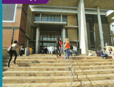
Building 13 016 910 3046