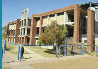
Building A7 018 389 2017